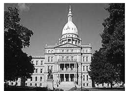
STATE OF MICHIGAN CAPITOL BUILDING

SB 505: To establish qualification for designation as primary caregiver for medical marijuana patient. Status: On Senate calendar for Nov. 29 for General Orders.